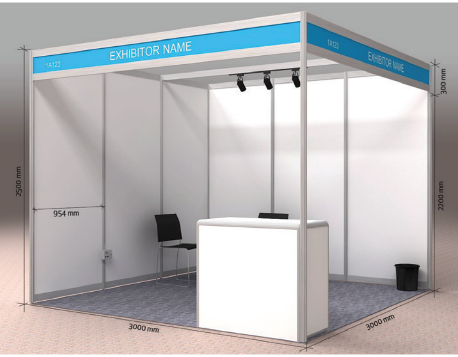
This picture is for representative purposes only.